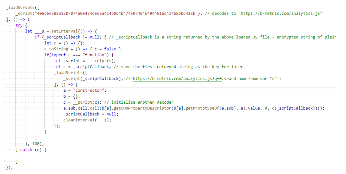
Figure 1 - Malicious loader decrypts and executes the JavaScript loaded from the attacker's server

The Baka loader works by dynamically adding a script tag to the current page (Figure 1). The new script tag loads a remote JavaScript file, the URL of which is stored encrypted in the loader script (Figure 2). The attacker can change the URL for each victim.